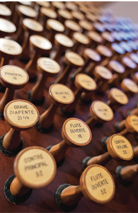
Above: The Calvary Grand Organ can mimic sounds of orchestral instruments.